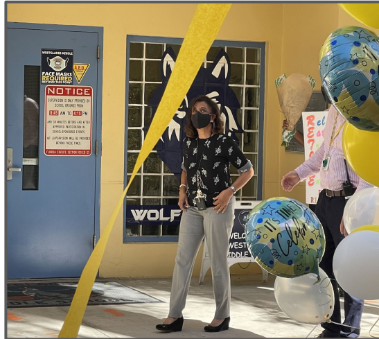
We will miss you!